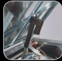
Electric Bed Lift