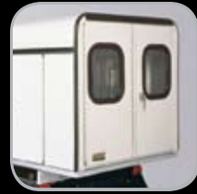
Custom Van Box