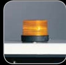
Safety Strobe Light