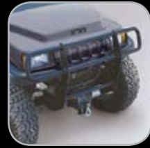
Heavy-Duty Brush Guard