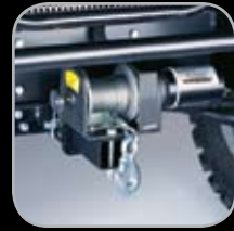
1,500 lb Winch