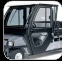
Certified ROPS Cab Enclosure