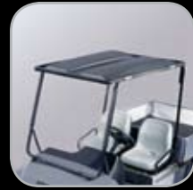
Canopy Top Black