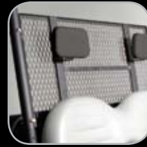
Rear Cargo Cage