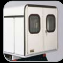
Custom Van Box