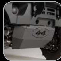
Front Steel Skid Plate