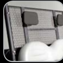
Rear Cargo Cage