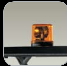
Roof-mounted Strobe Light