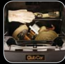
Underhood Storage (Gas Only)