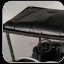
Plastic Canopy Top