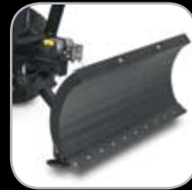
54- or 62-Inch Plow Blade