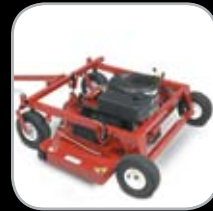
60-Inch finish cut mower