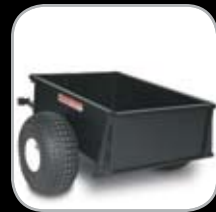
Swisher Dump Cart