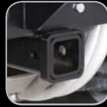
2-Inch Front Receiver Hitch