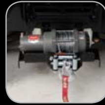
2,500 lb Warn Winch