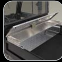
Cargo Bed Toolbox