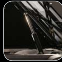
Electric Bed Lift