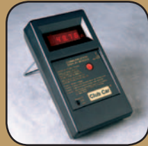
Communication Display Module

*Headlights, Taillights, Brakelights and Horn