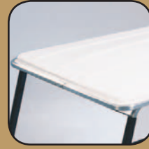
Canopy Top White and Beige