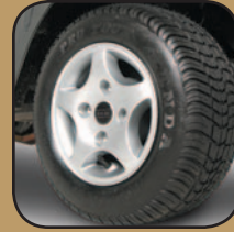
10-Inch Aluminum Alloy Wheels